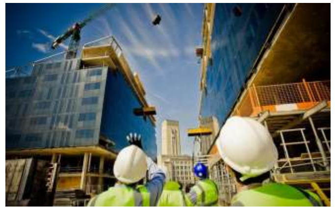
BUILDING AND CONSTRUCTION

We can also help you finance your business projects through commercial loans for loans based on type assets (factoring, leasing) equipment, commercial real estate, mergers and acquisitions. Our goal is to be able to respond favorably to your project. We listen carefully to the objectives and needs of our customers. Our offers are always tailor-made. Are you interested in investing in a company developing a potentially game-changing renewable energy solution? How about water infrastructure projects in Asia? Innovative ideas and materials are used in the construction of facilities. Or waste-to-energy solutions in CIS and other countries? Maybe projects of specific investment size and ROI. It is up to you. You tell us your investment criteria, and we will match you with the right venture.