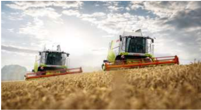
AGRO CULTURE SECTORE