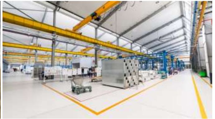
INNOVATION FACTORIES AND SYSTEMS